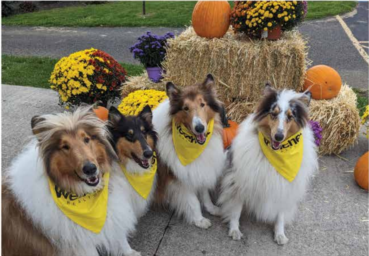
Sterling, Lucy, Wilson, and Phoenix at the Bethlehem Township Day Celebration

We've lived in Bethlehem Township with our Collies for Over 22 Years BECAUSE WE LOVE IT HERE!